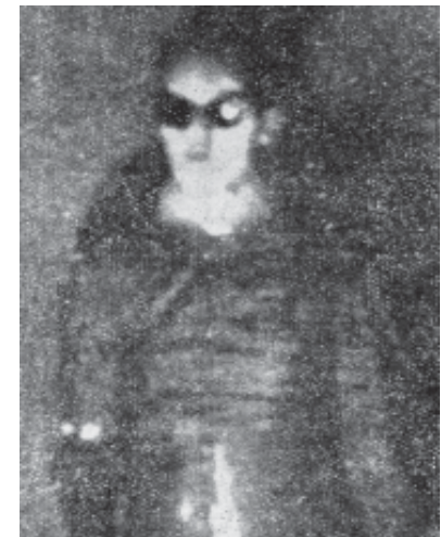
Extraterrestrial pilot.